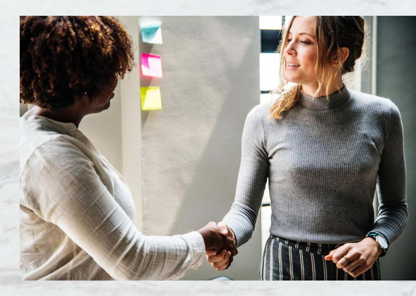
Extroverts love to meet new people. Introverts love to listen.