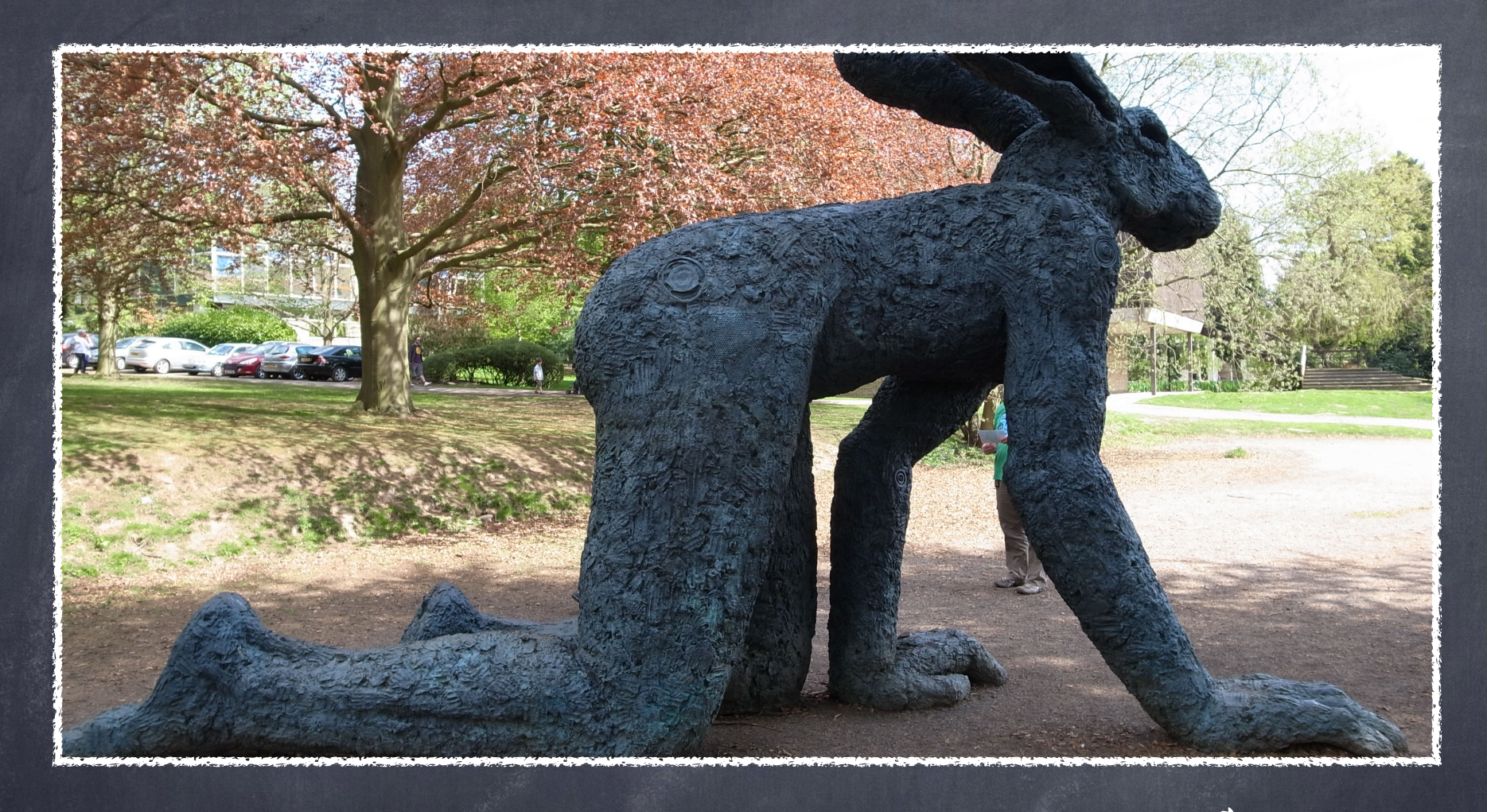
How hard can it be?