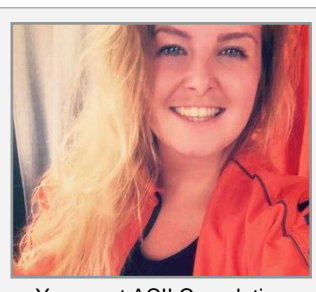
Youngest ACII Completion