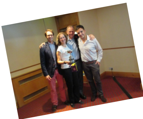
1 st The Young NAGs