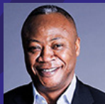
Rene Carayol MBE Attitude & Culture