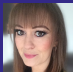
Alana Roche D&O Insurance

P rofessional ( top up your technical knowledge and industry awareness ) P ersonal ( enhance the 'soft' and 'business' skills crucial to your success ) P erformance ( be inspired to improve and grow ) P rofit ( strengthen your firm and your bottom line ) P ositivity ( grow your network and be proud of your industry )